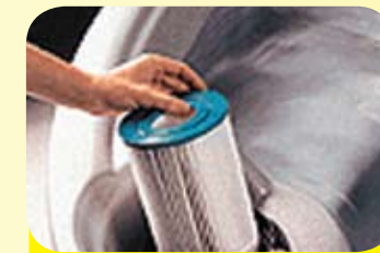
All Filters 10% off

Hyattstown: Thursday Night April 10, 4-7 PM Rockville: Thursday Night April 17, 4-9 PM Fairfax: Thursday Night April 24, 4-9 PM