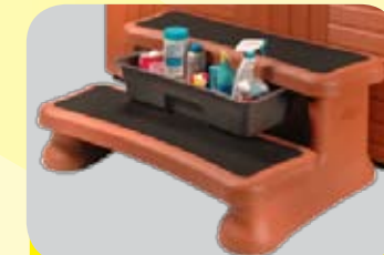
New Smart Steps All Steps 10% off

Refreshments and FREE Giveaways for everyone!