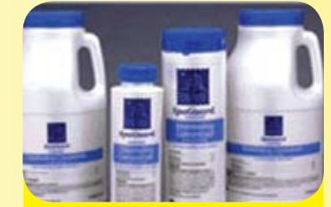
All Chemicals 25% off