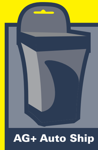
AG+ Auto Ship

If you're using the Everfresh Chemical System, you should be replacing your AG+ Silver ION cartridge every 4 months. Sign up for our AG+ Auto Ship program and receive a cartridge at your doorstep every 4 months. If you sign up at one of our VIP nights, you'll get FREE SHIPPING. This is an easy way to be reminded to change your cartridge!