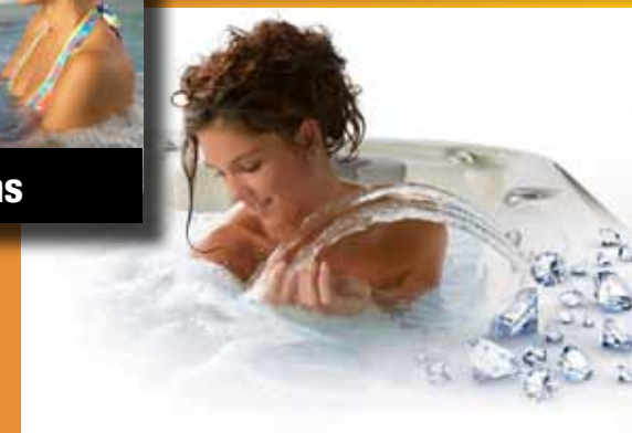
ACE Salt Water Sanitizing System

Come see us at VIP nights and we'll talk to you about trading in your hot tub and upgrading to a new one!! This is the biggest Trade-in event we've ever had!!!