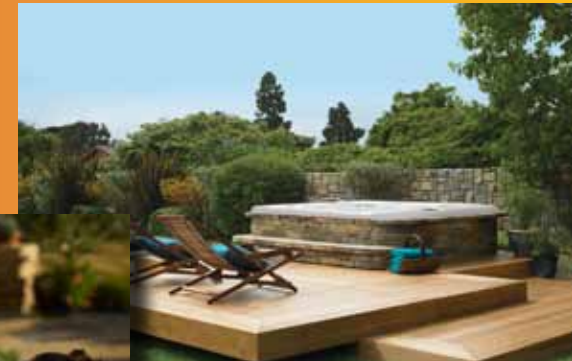
Beautiful Stone options