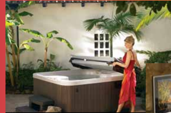
New Cover and Cover Lifter