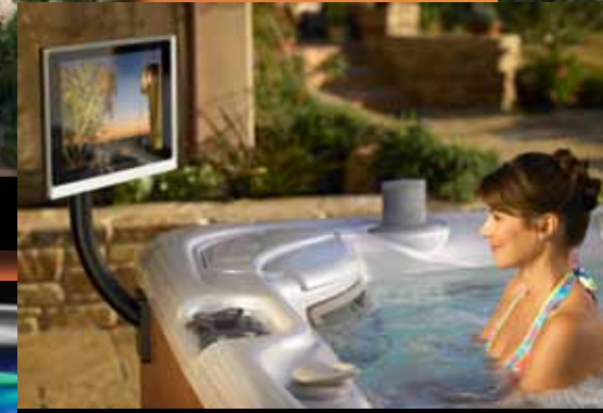
TV and Music Options